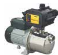
Water pump Pump not included. Please contact Davy Pumps for information.