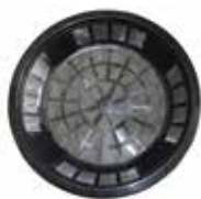
Inlet 400mm inlet strainer with light guard in tank lid.