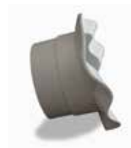
Overflow 100mm overflow with mosquito screen fitted to the tank wall.