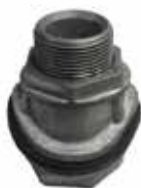
Outlet 25mm zinc outlet with watermarked brass ball valve fitted to the tank.